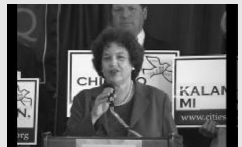
Mayor Lois Frankel addressing the Cities for Peace press conference July, 2007 in Washington D.C.

Our city of 100,000 people have already paid $122 million in taxes which could have provided healthcare, housing, teachers, and tuition for our students. While our soldiers are paying the highest costs for this war, the effects reach down to every single one of us. And the price is just not worth it.