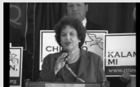
Mayor Lois Frankel addressing the Cities for Peace press conference July, 2007 in Washington D.C.

Our city of 100,000 people have already paid $122 million in taxes which could have provided healthcare, housing, teachers, and tuition for our students. While our soldiers are paying the highest costs for this war, the effects reach down to every single one of us. And the price is just not worth it.